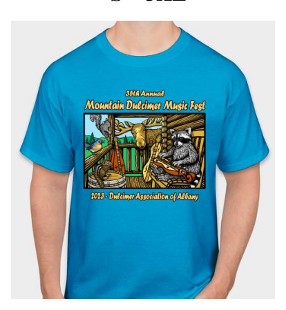
Sapphire S – 3XL