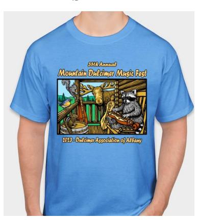
Carolina Blue S – 4XL