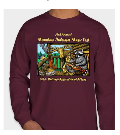
Maroon 3 – 4XL