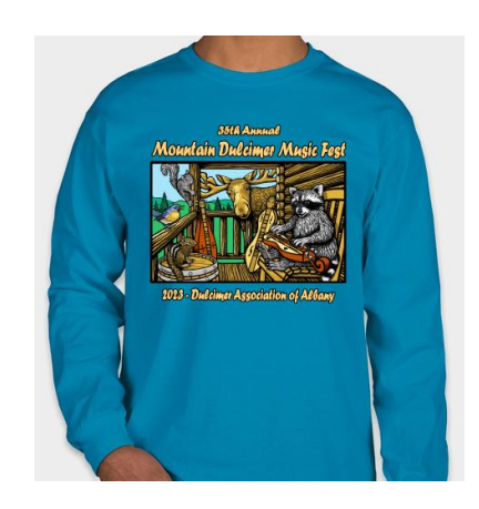
Sapphire S - 3XL