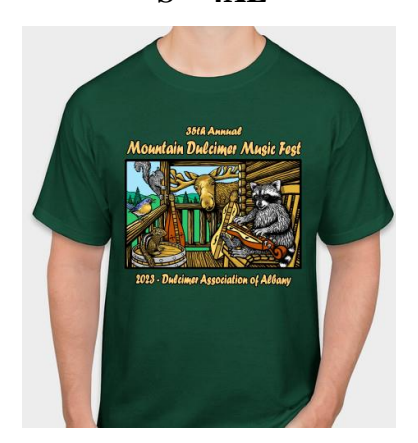
Forest Green S-4XL