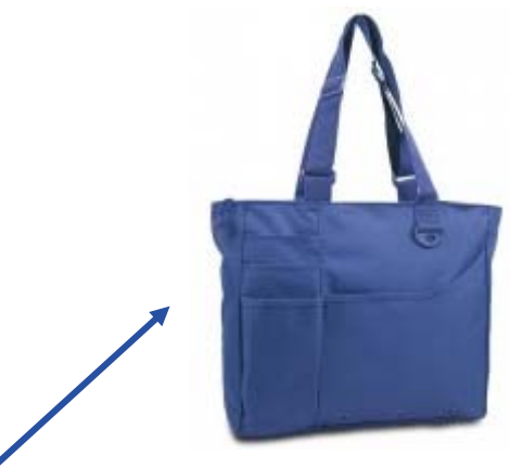
Printed on other side

Tote bags will be Royal Blue, printed with the same logo in white. They have a zippered main compartment, a contoured main front pocket, an inside zippered hanging pocket, a gusseted front- side pocket and adjustable handles. Size: 15" wide x 13" high x 4" deep.